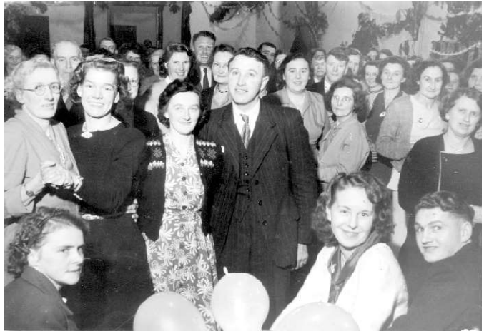
A Yew Tree Hall Dance from the 1950's.